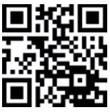
Our short clips illustrate the thieves' procedure

The thieves often work in groups: one of them distracts the victim by, for example, jostling him/her, asking for information, help or money. The next person uses this moment to steal the loot as fast as lightning from the bag or clothing and passes it on to the third person who disappears with it.